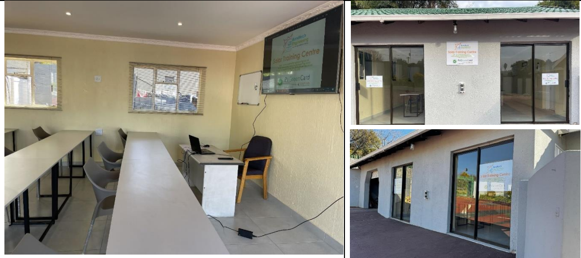
Solar PV installation for showcase/teaching purposes and a training inverter stations.