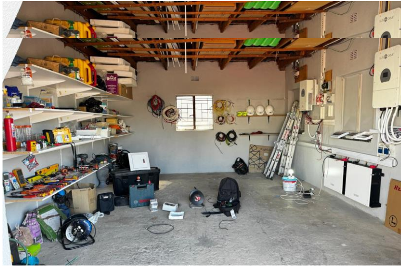
Store facilities to store Training tools, materials, and equipment.